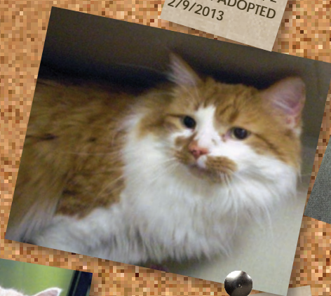
Milo: at IMHS 2 weeks, 1 day... ADOPTED 2/9/13