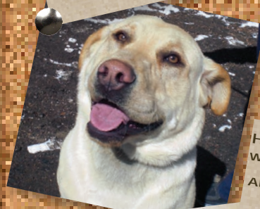
Hadley: at IMHS 2 weeks, 6 days... ADOPTED 3/10/2013