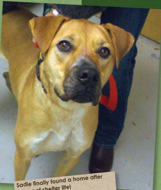
Sadie finally found a home after 1 year of shelter life!