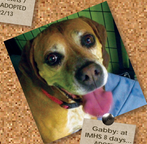
Gabby: at IMHS 8 days... ADOPTED 3/12/2013