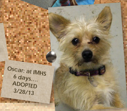
Oscar: at IMHS 6 days.... ADOPTED 3/28/13