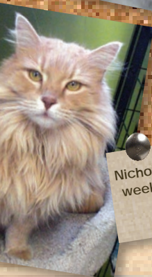
Nicholas: at IMHS 1 week... ADOPTED 1/27/13