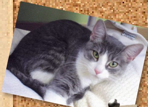
Chelsea: at IMHS 2 months, 5 days... ADOPTED 2/2/13