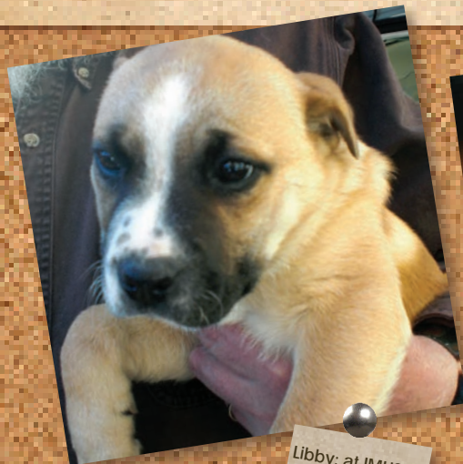
Libby: at IMHS 13 days...ADOPTED 2/3/13