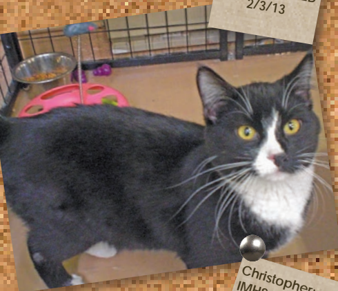
Christopher: at IMHS 2 weeks, 2 days... ADOPTED 2/9/2013