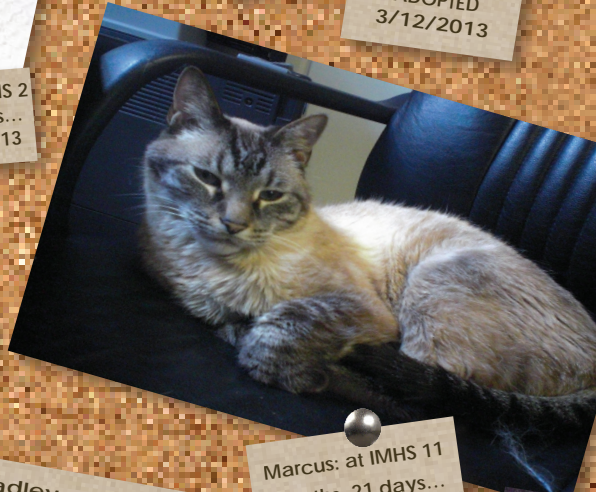
Marcus: at IMHS 11 months, 21 days... ADOPTED 3/6/13